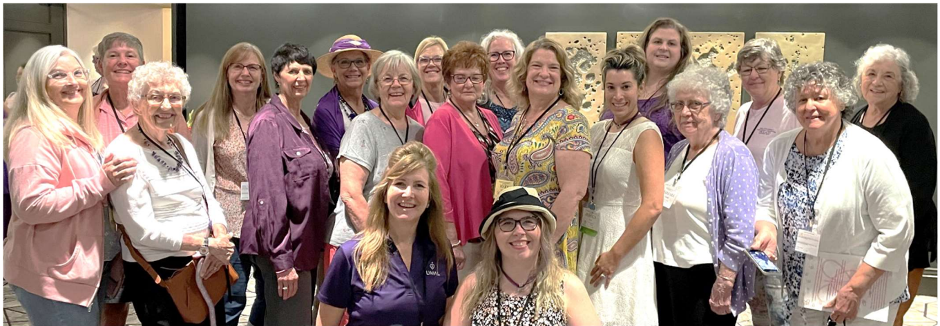
Members of our Dal-North Zone gathered for a picture after one of the convention sessions.

Highlights from the convention including the worship service, speakers, Bible studies, and humorous interrupter will soon be available on the LWML Texas District YouTube channel. Because the recorded data is a large file it will take time to get it into viewable segments and the goal is to have it in place by mid-July. You can access this YouTube channel by clicking the YouTube icon in the top right corner of any page at www.lwmltxdist.org .