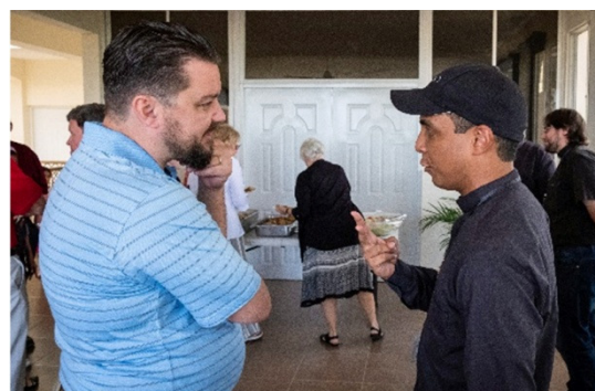
Speaking with a seminarian from Caracas Venezuela ↑

Worship at Palmar Arriba. All the services were in Spanish, but followed the very familiar orders of service from the Lutheran hymnal ↓